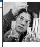
■ Figure 3.2 ■